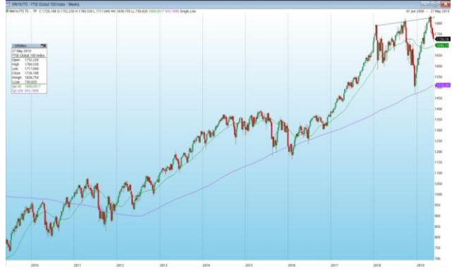
FTSE Global 100 Index

The past years have shown how difficult it is for investors to navigate ever more complex and at times seemingly irrational markets. This is where Incrementum All Seasons Fund will help. After all, over the further course of 2019, the outlook continues to remain rather challenging. An inverted yield curve, driven by plunging 10-year yields, declining copper and other commodity prices, a still surprisingly resilient (i.e. strong) US Dollar, and generally weakening economic surprise indices do not bode well for equities nor bonds, which display the worst risk-/return ratio on record, over the further course of the year.